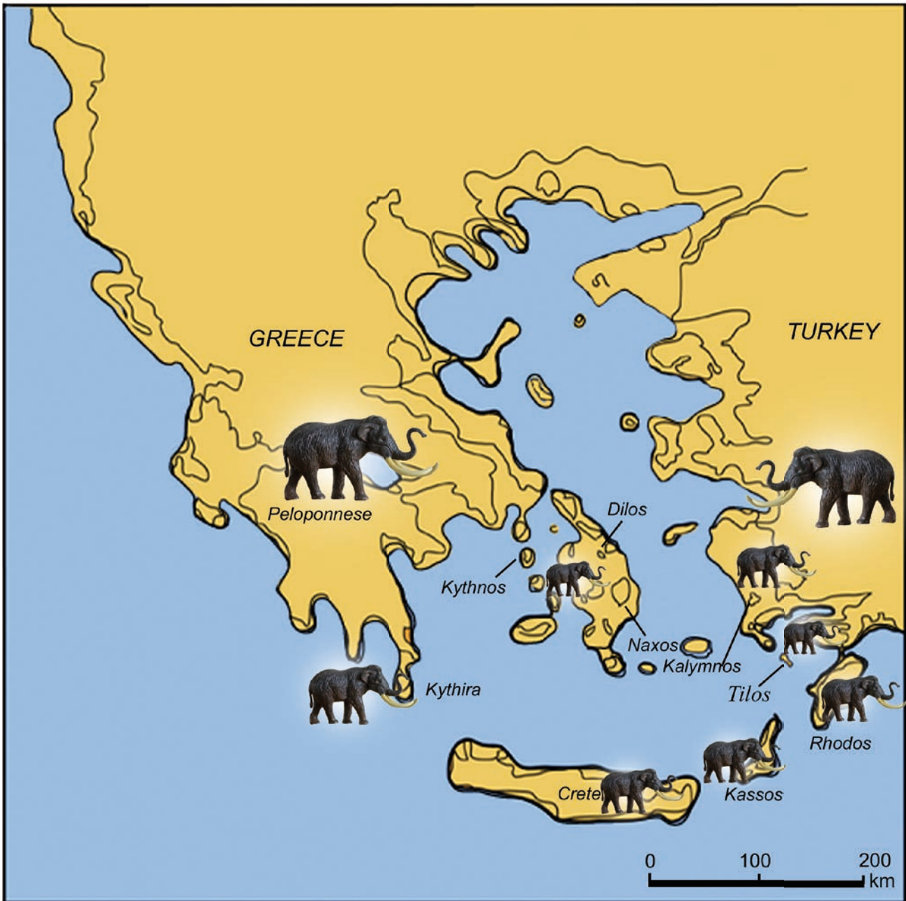
Text-fig. 3 Simplified palaeogeographic reconstruction of the Aegean region during the ^{18}\text{O} Marine Isotopic Stage MIS 6 (low sea-level of the glacial period Riss/Saalian) between 180–140 ky ago (modified from Lykousis 2009). Schematized strait tusked elephant pictures and the names of the islands indicate the main occurrences of more or less dwarfed elephants in the Aegean as discussed in this paper.

and south of Attiki respectively. The Island of Crete became definitively isolated from the continent in Early Pliocene (Piper and Perissoratis 2003, Perissoratis and Conispoliatis 2003, Anastasakis et al. 2006, Lykousis 2009). The rest of the southern Aegean domain remained connected to the continent and mostly occupied by lakes. During the Late Pliocene – Early Pleistocene, between 3.2–2.0 My ago, the sea invaded much larger areas, in particular by penetrating the Evoikos Gulf to the east of Attiki (Anastasakis et al. 2006). This is also the time interval during which a new marine connection between the southern and northern Aegean basins settled (mid Aegean trench), thus separating the eastern and western parts of the Aegean domain. Despite a progressive