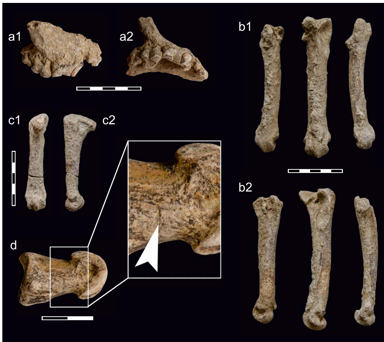
Text-fig. 2. Pavlov II site – selected mammals remains. a. Wolf ( Canis lupus ) – right maxilla, 12 year old individual with heavily worn teeth (P 4 – M 2 ), 1 – buccal view, 2 – occlusal view; b. Cave lion ( Panthera spelaea ) – right 2 nd , 3 rd , 5 th metatarsal, 1 – palmar view, 2 – external view; c. Brown bear ( Ursus arctos ) – right 3 rd metatarsal, 1 – palmar view, 2 – external view; d. Reindeer ( Rangifer tarandus ) – cut mark located near the distal articulation end of a 2 nd phalanx.

The reindeer remains in this site are lacking the body parts found in other Central European open air sites which contain abundant reindeer remains (e.g., Moravany Lopata, Trencianskie Bohuslavice, Grubgraben, Sagvar). At Pavlov II, there are no cranial elements (in particular teeth), and there are only three relatively small antler fragments. A greater diversity of reindeer skeletal elements was found at the other sites, including numerous teeth and fragments of crania and mandible which sometimes dominate over all the other elements (Vörös 1982, Logan 1990, Lipecki and Wojtal 1998, Vlačičky 2012). A somewhat similar situation to that in Pavlov II is observable at the Late Gravettian site Jaksice II (Poland), where cranial elements of reindeer are also missing. However, Jaksice differs in other ways from the Moravian sites in having very low counts of distal parts of limbs, vertebrae, and ribs. The composition of skeletal parts at Jaksice could be explained by transport of only selected parts of animal carcasses from a long distance (Wilczyński 2015). But the