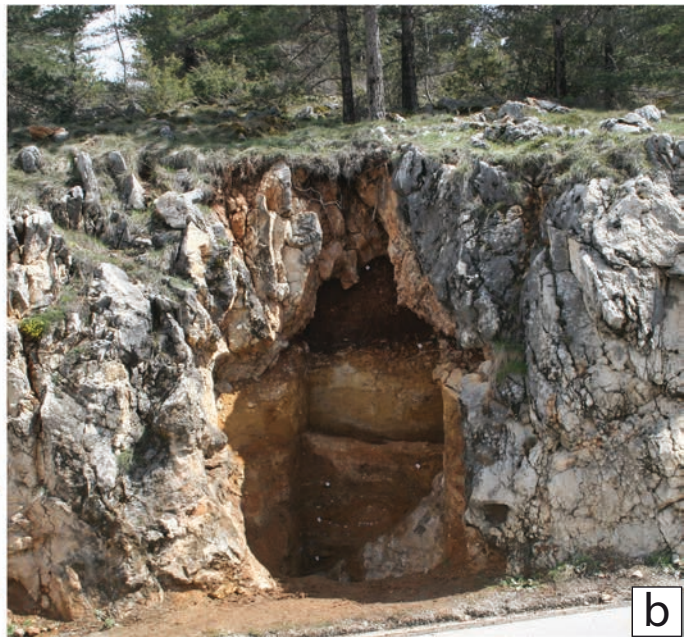
Text-fig. 1. Geographic position of the Trlica locality (a) and its appearance (b).

The Trlica formation taphocoenoses corresponds to the time when early Homo penetrated into the eastern Mediterranean. The study of the fauna from this locality characterizes the environments encountered by the most ancient hominid migrators in Europe.