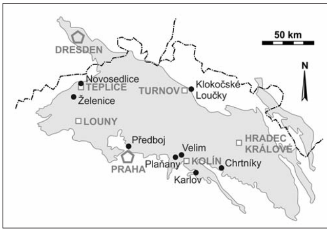
Text-fig. 1. Simplified map of the Bohemian Cretaceous Basin (BCB, the Czech Republic), showing the occurrence of Filogranula cincta (GOLDFUSS) in the Bohemian Cretaceous Basin: Předboj, Plaňany, Velim-Skalka, Kutná Hora-Karlov, Chrtínky, Novosedlice (“Weisskirchlitz”), Želenice nad Bílinou (“Schillinge”) and Klokočské Loučky.